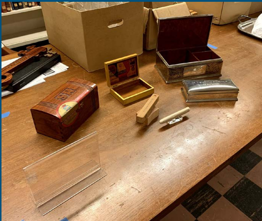
Cigar and Cigarette Display (Above Left) Sam Rayburn Testimonial Dinner (Above Right) Texas Gavels (Right)