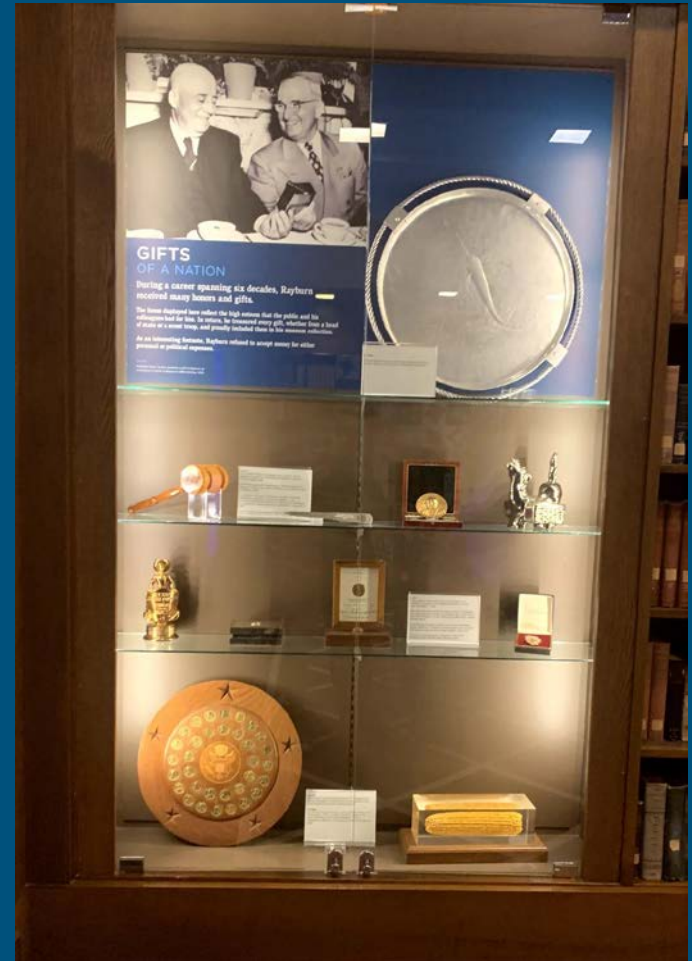
Fall 2018 - Summer 2019 Display